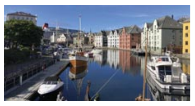
Ålesund harbour looking SW towards bridge at far end of Brosund

①+47 95883400 vakta-hav@alesund.havn.no alesund.havn.no