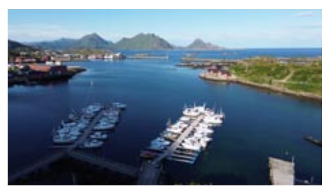
Ballstad: guest berths on pontoon hammerheads in SW corner of harbour John Sadd

Two 25m hammerheads for visitors in SW arm of harbour yacht marina. 2.5–3m, water and electricity, hotel with restaurant