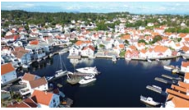
Skudeneshavn looking SE past visitors' berths

Washing machines and driers need 10/20 NOK pieces (August '23). In an almost 'cashless society' and banks which don't handle cash, coins can be hard to come by. Supermarkets are about the only source