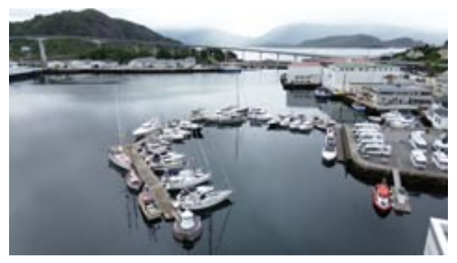
Måløy visitors' marina looking SE towards 40m bridge