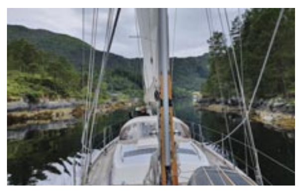
Narrow passage S of Remøya to avoid Aursund 16m bridge John Lancaster-Smith

Add The 16m bridge near the N end of Aursund can be avoided by passing W of the island Røttoya. 28m bridge. The passage S of the island is narrow (27m), depth charted 2.5m.