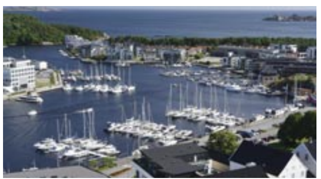
Mandal visitors' pontoons in foreground, looking SE to entrance John Sadd

① +47 982 47 262, ①+47 400 05 152, mandalhavn@mandal.kommune.no, velihavn.no/gjestehavner/mandal-gjestehavn