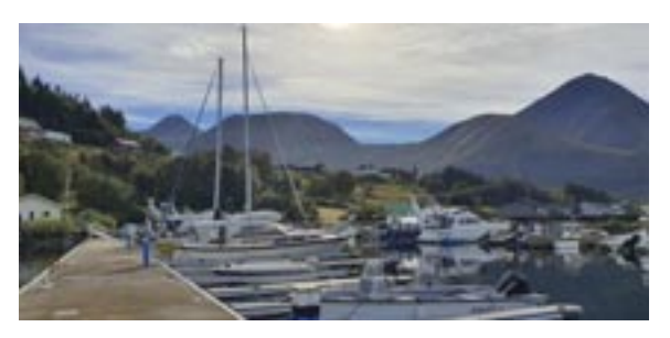
Sætre (Vartdal) Hans-Petter Sandseth

The village is Sætre. The marina is Vartdals Småbåtlag. N/S concrete pontoon. Moor on E and N sides. Toilet in service