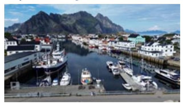
Henningsvær looking NE; main guest berths in foreground John Sadd

Add position: Anchorage to NE: 60°09'.9E 14°14'E