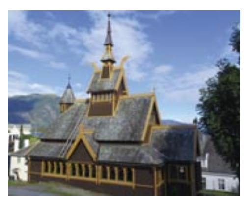
The English church in Balestrand