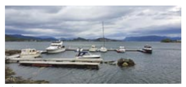
Gåsholm, Ålesund Seilforening Seilerhytte marina Hans-Petter Sandseth