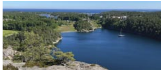
View S over Lusekilen from the top of Videheia to its N Hamish Wilson

New LUSEKILEN 58°11′·65N, 8°16′·99E Anchorage N of the Blindleia, SSE of Ingridsnes. Anchor near head in 10m; mud. Good view from top of Videheia to N.