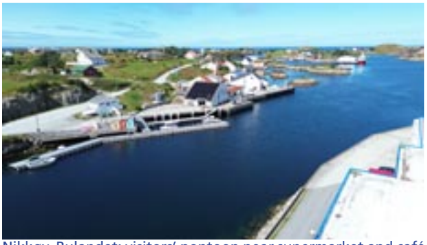
Nikkøy, Bulandet: visitors' pontoon near supermarket and café

Add Ferry to Hardbakke. From Hardbakke, bus to Krakhella, then fast ferry to Bergen (see p.153,).