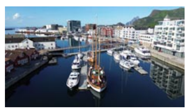
Svolvær: guest berths NE of bridge to Lamholm, looking across bridge to town centre berths John Sadd

More room for visitors with new pontoons NE of bridge to Lamholmen Island. Deeper (3+m) and quieter than outer end of the old longer pontoon near town square. Water and electricity.