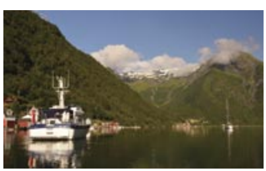
Esefjord, Balestrand small boat harbour and fjord anchorage