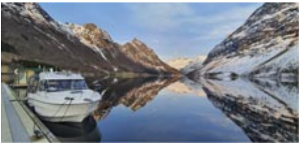
Urke Norangsfjord Hans-Petter Sandseth

New URKE, NORANGSFJORD 62°12′·6N 6°34′·6E Pontoons at W end of Urkebukta bay on N side of Norangsfjord, 1·3M E of junction with Hjørundfjord. Depth 10m. Electricity, water. Pub/café. In summer, local produce can be bought at a local farm. Good day mountain hikes.