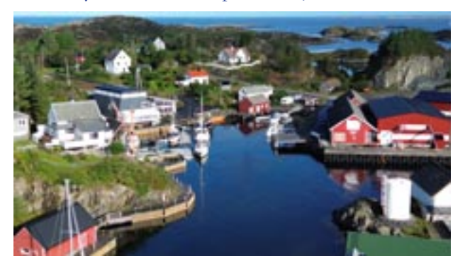
Værøyhamn looking past visitors' pontoon in NW corner of harbour John Sadd

Add Toilets, showers, launderette. No fuel. Ferry to Askvol from ferry terminal near supermarket, c.20mins walk to S.