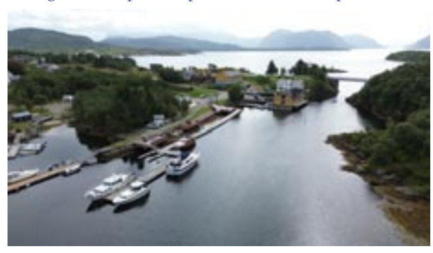
Korssund looking SE to 8m bridge John Sadd

Change 1.5: 'deep water pontoons' to 'outer pontoon'.