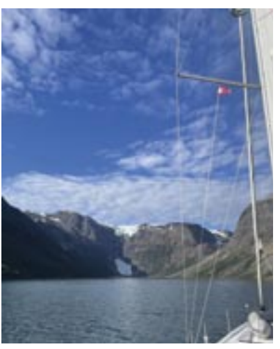
Jøkelfjord at midnight in early July Will Eaton

Good holding off Vika at 70°04′·3N 21°59′·2E; 8–10m. Local moorings and steep shelving make access to the anchorage marked 'J' tricky for more than 1 yacht. 'Ecopod' style hotel on the beach at Jokelfjordeidet (position given in the book).