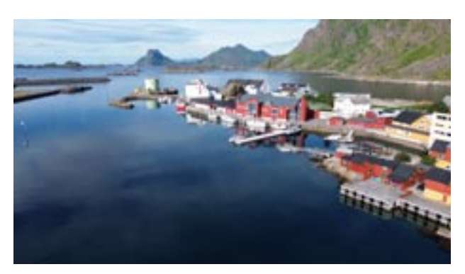
Stamsund: guest berths SW of pub and restaurant John Sadd

Enter N of Stor Buøya. No access between Buohavn and main Stamsund harbour. Pontoon.