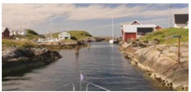
Bjørnsund. Narrow entry. Yacht alongside on guest quay

Not advised, although in settled weather this might be possible N of Nordre Bjørnsund in the bay between Måøya to its NW and the causeways lining it to Maøya (11m; open to NE).